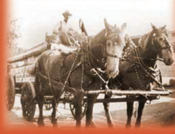
In the early years, wood was a major source of fuel. A cord of prime hardwood, cut and split, could be hand-delivered by horses for the sum of $3.