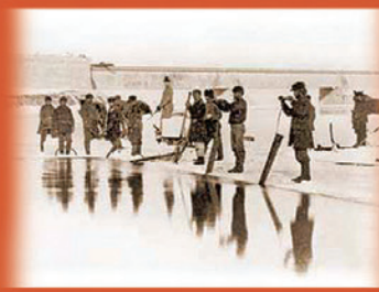
In 1905, the multifaceted Sarjeant Company Limited was in the ice business. In those days, the major method of refrigeration came from ice that was cut out of Kempenfelt Bay, stored in sawdust and delivered to local homes.