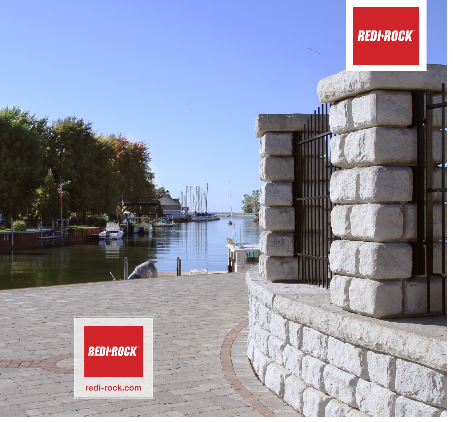
Every Redi-Rock Retailer is independently owned and operated.